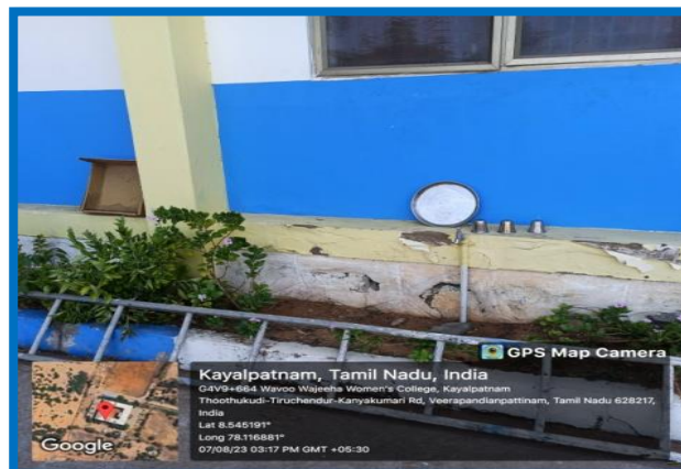
Fig: 1&2 Waste water passing in Garden