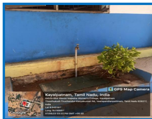
Fig : 3&4. Hand washing water passing in Garden